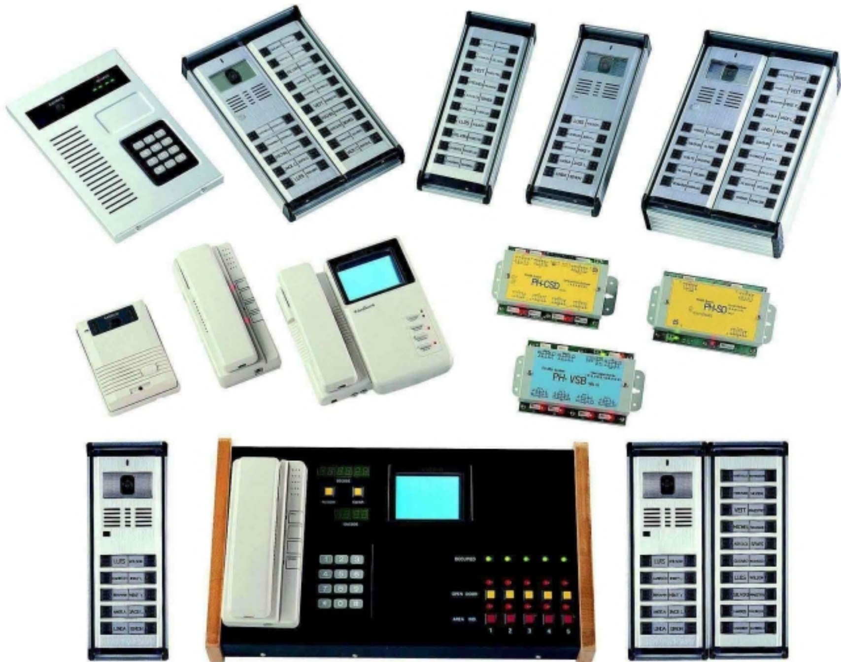
PH-855 Items Kanrich Electronic Corp.